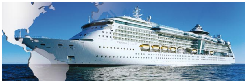
Easy electronic procurement of OEM spare parts from Aalborg Industries

Aalborg Industries began using ShipServ's trade system five years ago. In the past two years we have seen a rapid increase in transaction volume, and together with the general development in e-procurement, this led to the decision to make the integration of our spare parts sales system with ShipServ's TradeNet.